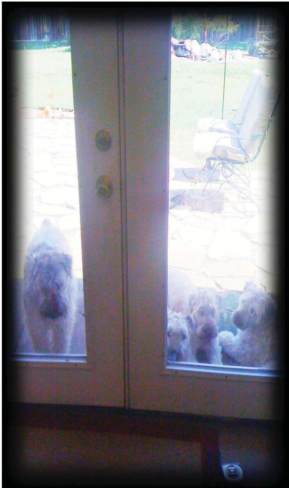
The family in the "Waiting Room" during a delivery....